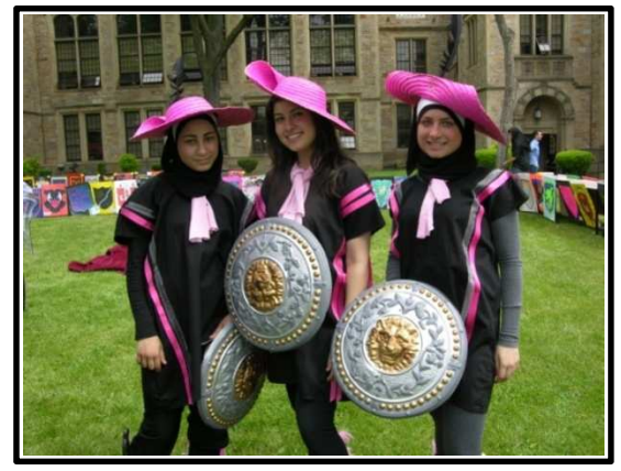
The Three Musketeers