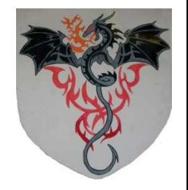
2009 Winning Shield

The 7th annual Fordson Renaissance Festival is a part of an exciting tradition. On May 28, 2009, almost 200 students participated in an Elizabethan Feast, medieval jousting (with decorated wagons), ax throwing, a coats-of-arms contest, arm wrestling competition, Shakespearean play reenactments, and a cake eating contest.