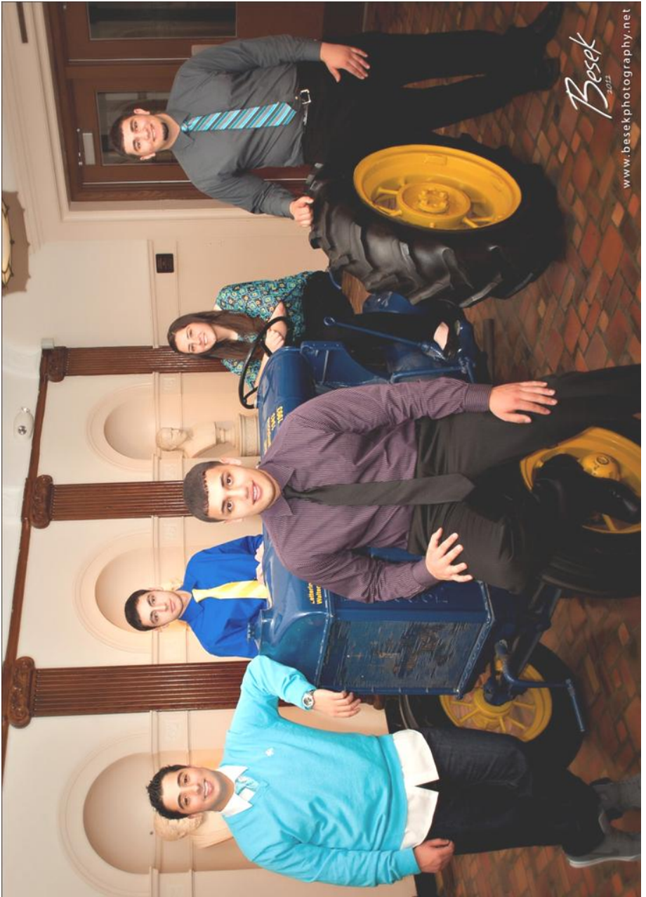
2012 Recipients of The Brehm Scholarship for The University of Michigan