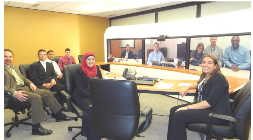
Fordson students receive advice from Cisco advisors over Telepresence