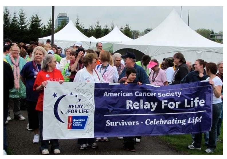
Relay for Life walkers lining up at the beginning of the event

medical people felt sorry for the skeletal looking prisoners, but the food was too rich for the near-starved, shrunken-stomached men. After a couple of weeks of being bedridden and sickly, weight began to increase, and health returned to most of the ex-prisoners.