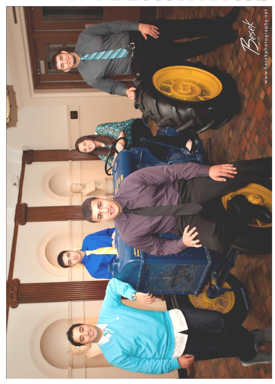
2012 Recipients of The Brehm Scholarship for The University of Michigan